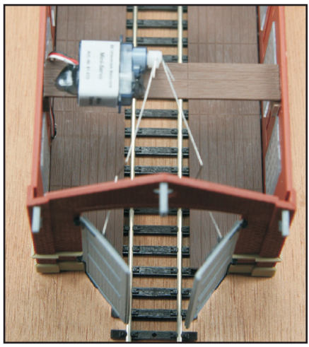
An axial offset is possible if the control wires are bent.