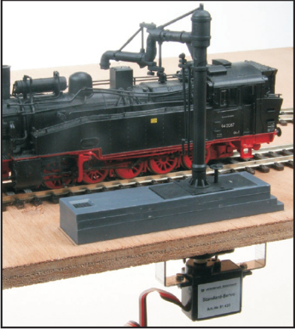
The direct connection of water crane and servo axle makes a precise positioning at the stop possible.